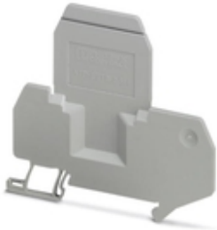
Partition plate, length: 74.3 mm, width: 2.2 mm, height: 70 mm, color: gray

Please be informed that the data shown in this PDF Document is generated from our Online Catalog. Please find the complete data in the user's documentation. Our General Terms of Use for Downloads are valid ( http://phoenixcontact.com/download )